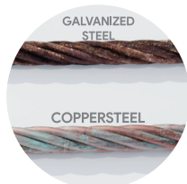
Comparison of materials after 10 years driven into the soil.